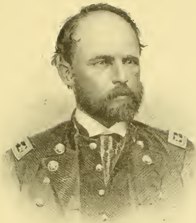
GEORGE J. STANNARD, BREVET MAJOR-GENERAL U. S. V.